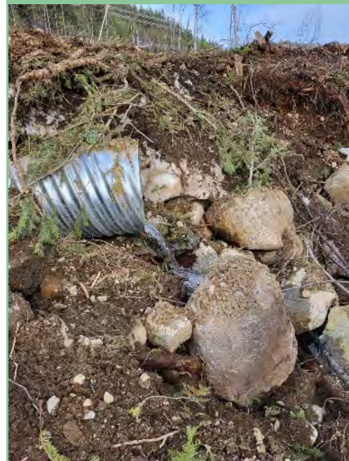
During construction the road building contractor ‘armored’ the culvert with rocks at the outlet designed to dissipate water velocity and mitigate erosion.