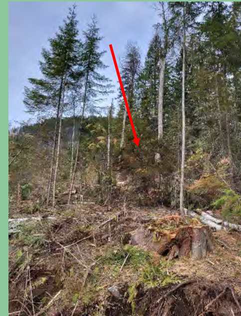
The Qualified Logging Professional harvesting this site recognized and retained a Pacific yew ( Taxus brevifolia ) tree. The harvesting is on private land where Atco purchases logs.