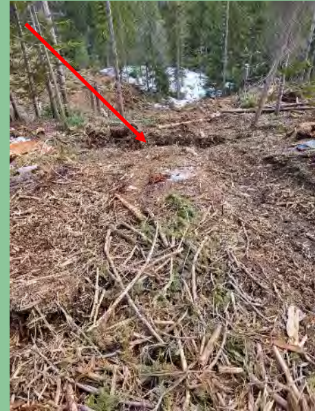
As required by BC Regulation and Atco’s sustainable forest management system, Atco controls drainage regarding on-block skid trails. Evident in this photo is a cross ditch preventing water from running downhill on a skid trail and perhaps creating a new watercourse.