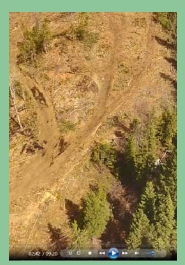
An example of rehabilitated skidder trails and in-block roads following winter harvest operations.