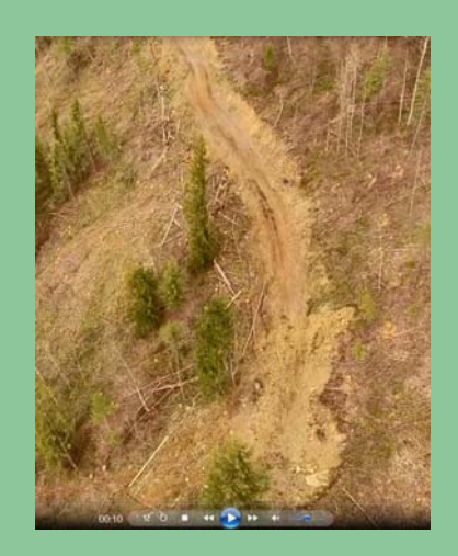
Drone footage enabled inspections to focus on block harvest objective achievement, including road construction, and rehabilitation.