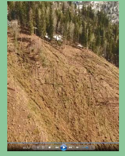
Areal drone footage from a recent harvest block under Atco management. The audit noted significant in block retention.